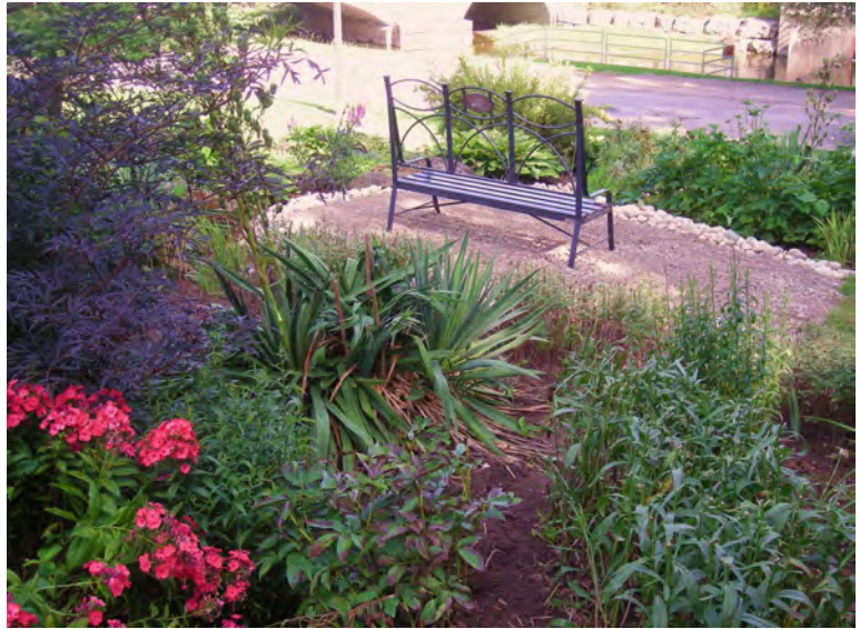
Centre Street Perennial Bed

Another accomplishment was erosion control at the Centre Street bed. We fortified the area under the seat with more crushed rock, added river rock to the edges of that area and put in a "dry stream bed" to direct rainfall to the front bottom of the bed -all we need now is the rainfall to see if these modifications will help! Once again Mike saved the day and Dennis Rawe provided all-season long help with maintenance and planting new specimens in this bed.