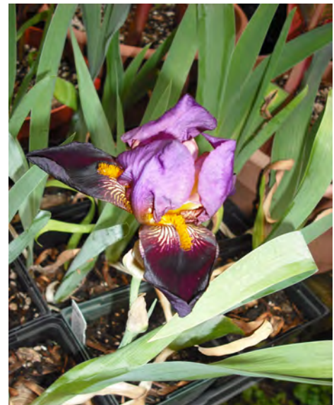
City of Stratford iris