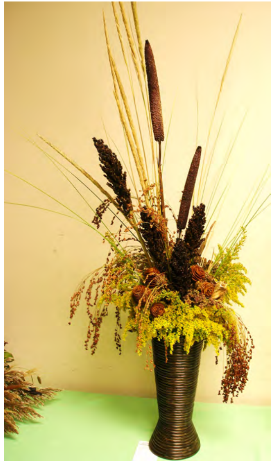
September 2011 Flower Show

The SDHS Exhibit and Floral Design Committee wants to extend their congratulations to ALL exhibitors from the June Flower Show. What a show it was! The peonies were outstanding and a big THANK YOU goes out to Darlene and Flo Bowman for their tips on holding peonies in limbo previous to a flower show! We had 25 adult exhibitors, 9 of whom were novices! It is nerve wracking to get entries ready but didn't you all have fun? There was a total of 154 exhibits and 47 of those were in design categories! What inspiring designs they were too! Considering we had a fairly new committee, started too late and had a new venue to set up, I was very pleased with the results. Thanks to everyone for their constructive comments and we are taking them seriously for next years' event. If there is anyone out there who would be interested in joining our committee, we'd be delighted to welcome you on board. We've worked out most of the "bugs", so I'm expecting everything to go smoothly next year. (Gardeners are such optimists!)